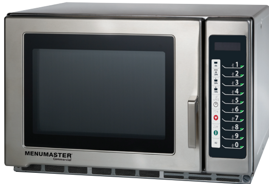
Model RFS518TS shown